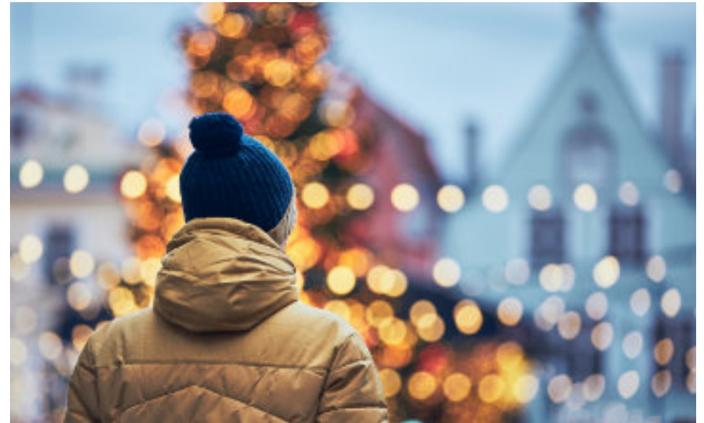
Looking ahead to the festive season with Ruskington Parish Council.

another project from the lovely people at mySociety